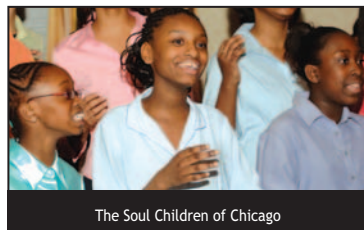
The Soul Children of Chicago